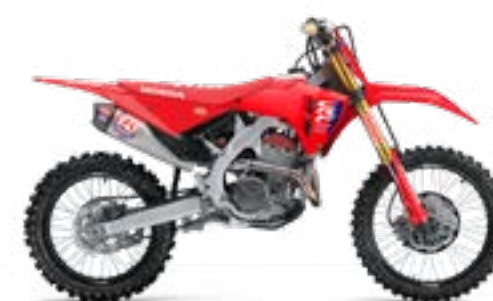
Extreme Red New