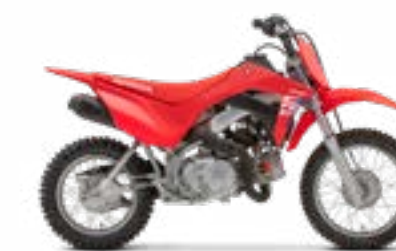
Extreme Red New