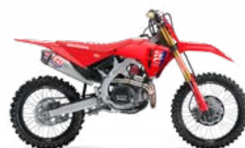
Extreme Red New