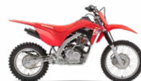
Extreme Red New *Big Wheel variant also available.