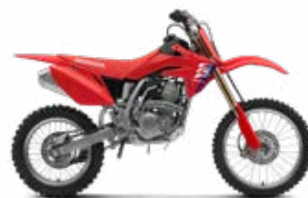
Extreme Red New