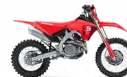
Extreme Red New