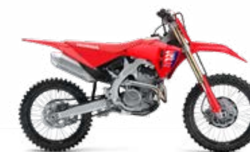
Extreme Red New