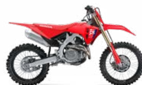
Extreme Red New