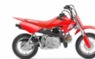
Extreme Red New